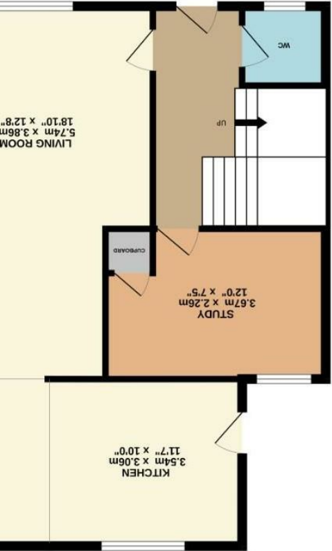
GROUND FLOOR 75.3 sq.m. (811 sq.ft.) approx.